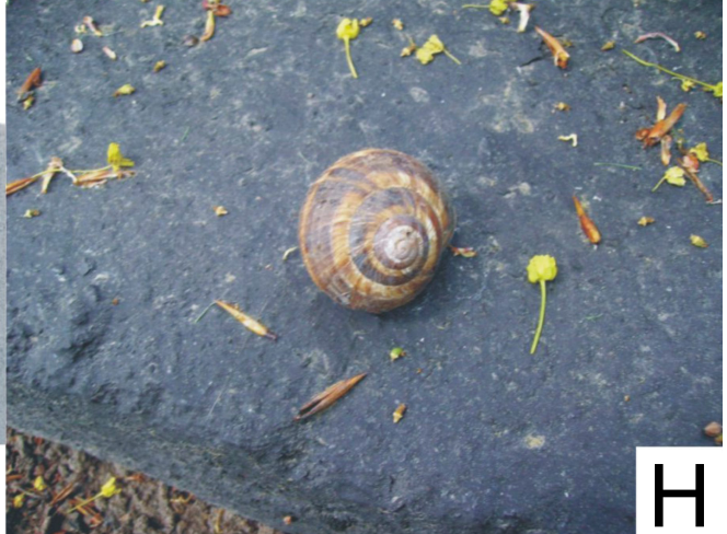
Fig. 2. See previous page.