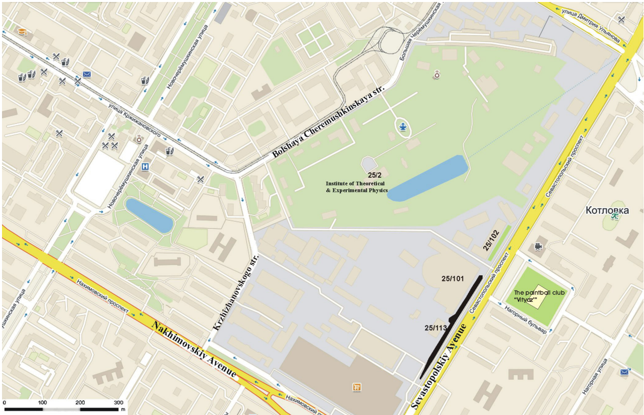
Fig. 1. Scheme of the Helix l. lucorum location in the city of Moscow (black filling).

ing to the ITEP staff, the colony appeared in the mid-late 1960s. It is possible that snails were used as laboratory animals for experiments and were accidentally or intentionally released into the park.