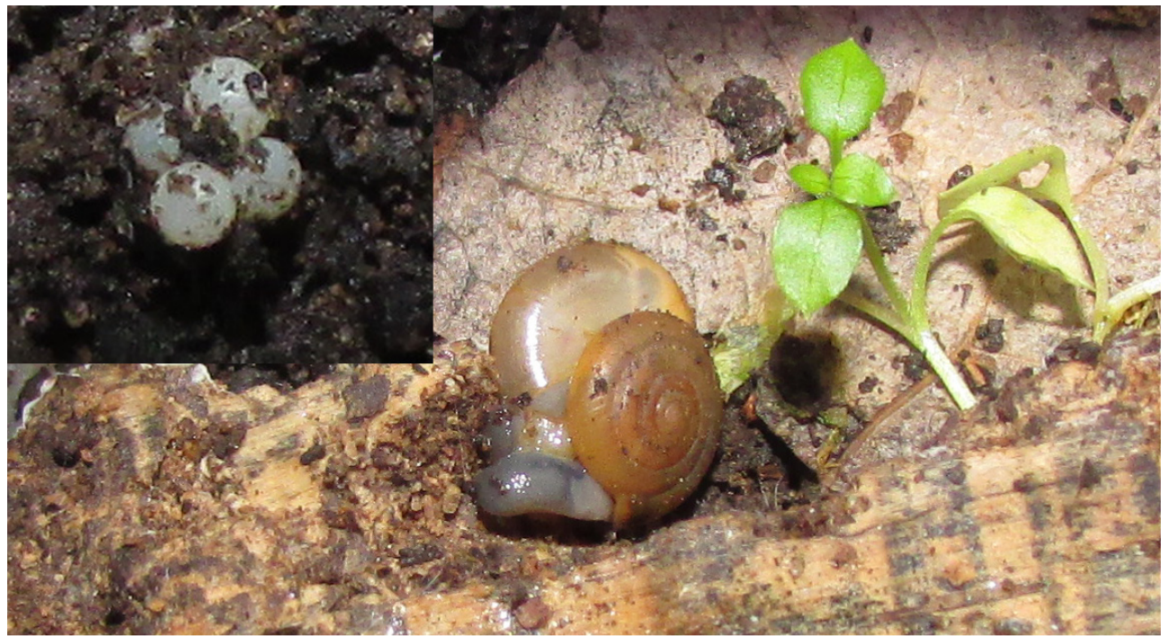
Fig. 3. The individuals of O. camelinus kept in the terrarium in copulation, and a clutch of four eggs.