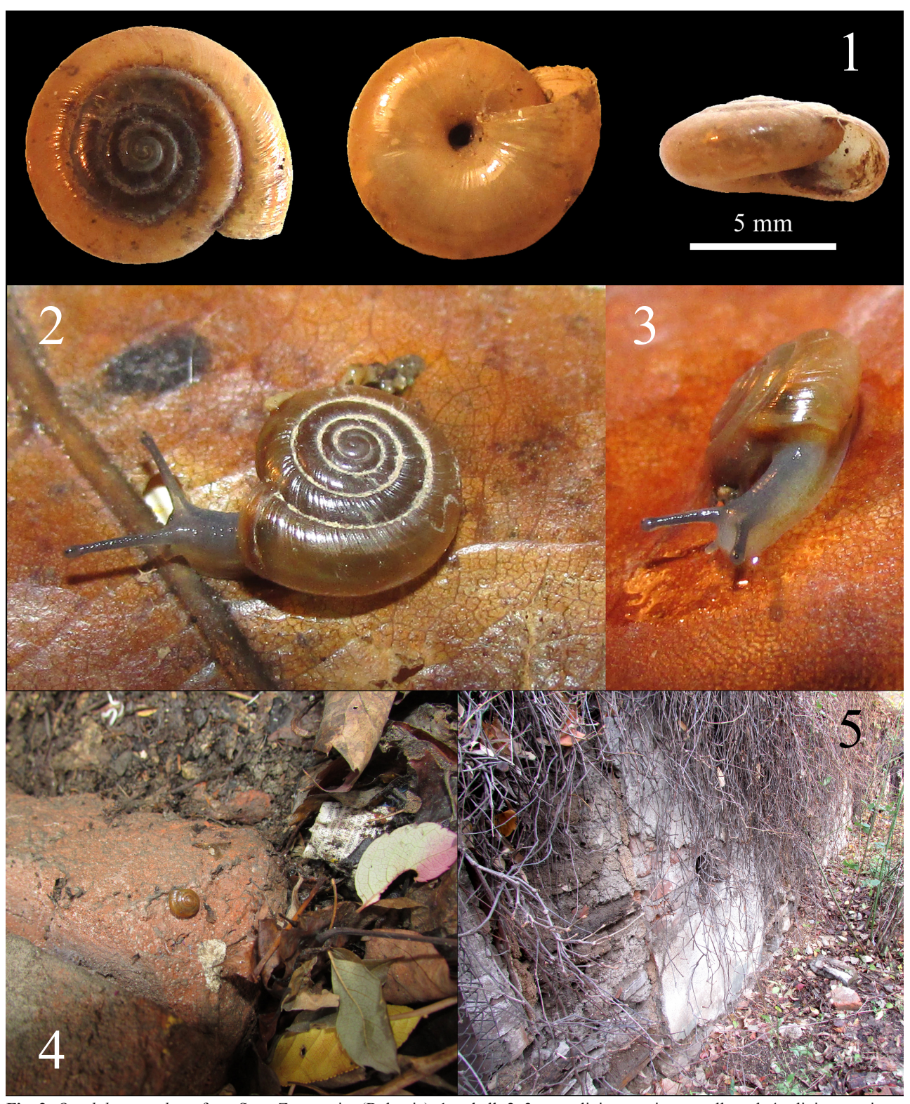
Fig. 2. Oxychilus camelinus from Stara Zagora city (Bulgaria): 1 – shell; 2, 3 – two living specimens collected; 4 – living specimen at its habitat; 5 – habitat of collected specimens.

camelinus thracicus differs from the nominal subspecies in its shell size. All the collected specimens were smaller than the minimal width of the nominal species (9 mm), and thus may be this subspecies, however, further research is needed to clarify the taxonomic position of O. c. thracicus . It is not clear whether it is a valid subspecies or if the small shell size might result from unfavourable environmental conditions differing from those in the original distribution area (if the species is introduced). It is likely that