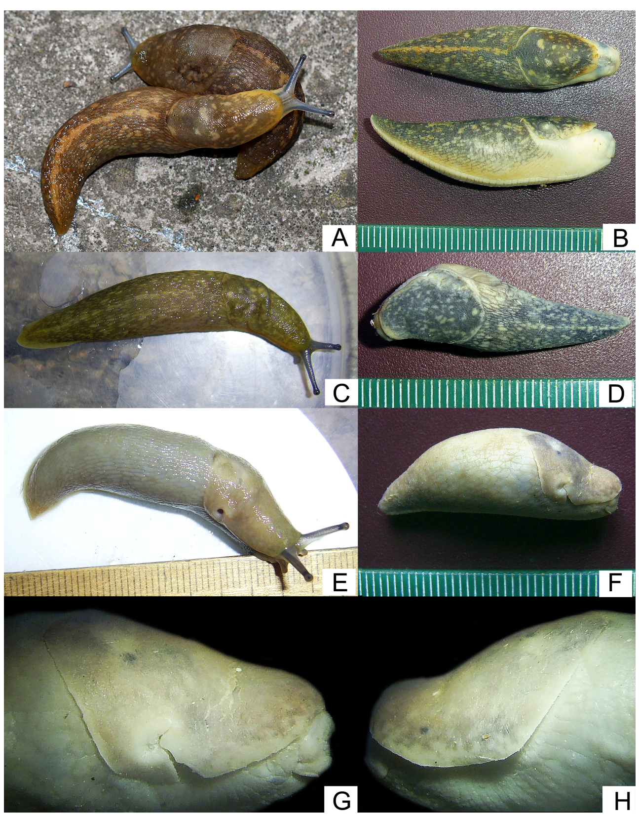
Fig. 1. Appearance of L. flavus from Lviv: A, B – site No. 1; C, D – site No. 3; E, F – atypically coloured slug, site No. 2; G, H – the mantle of the same specimen on both sides.